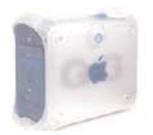
PowerMac G3 B&W